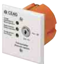
F3 remote indication flush-mounted