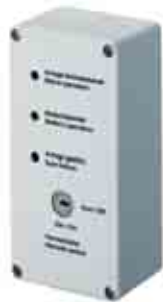
F3 remote indication