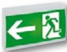
48011 1-3/D LED CGLine IP 41 with cover PL