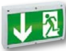
48011 1-3/D LED CGLine IP 54 with cover PU