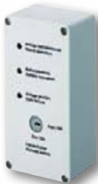
F3 remote indication