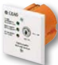
F3 remote indication for flush-mounting