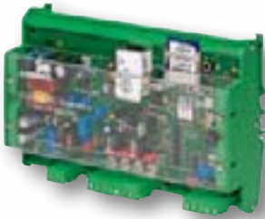
CGLine Web-Interface with integrated webservice