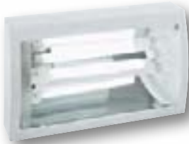
40031 CG-S IP 41 with transparent cover