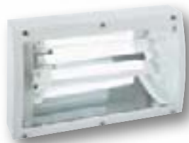
40031 CG-S IP 54 with transparent cover