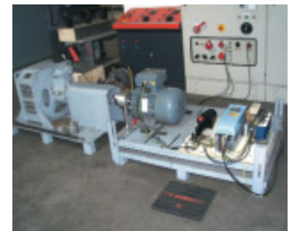
Picture 4: Test arrangement for testing switching contacts of explosion-protected plugs and sockets (source: Cooper).

ly safe current loop (NAMUR signal), the status of the plug-and-socket connection can be continuously reported to the central control system via an auxiliary contact and remote I/O. By this means, process flows can be controlled and, for instance, in case of an emergency, the processes can be shut down under full control, i.e. the release of given processes can be prevented or affected areas of the process technology can be relieved.