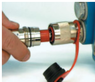
Picture 6: Field device with explosion-protected plug and socket in nickel-plated brass (source: Cooper).

These compact components do not have make-and-break contacts to switch off the voltage in the bushes of the sockets and couplers when separated, instead they provide reliable explosion protection by a flameproof encapsulation of the contacts during the plugging and unplugging process. This protection is attained by dividing the plugging and