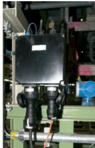
Picture 3: Socket combinations with flange socket, 4-pole, 500 V (32 A) for drive power supply and 3-pole, 24 V (16 A) for TMS. The blue connection cable for the intrinsically safe auxiliary contact can be seen clearly.

rectly when the plug is locked in the socket. In all cases, high-quality switch mechanisms are used which are fully functional even at full inductive loads (AC-3 switching capacity). The status of plugs and sockets of such design can be monitored via parallel auxiliary contacts and can therefore be integrated in the production process.