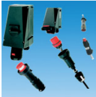
Picture 1: Explosion-protected plugs and sockets from 10 A to 125 A.

A new system of electrical plug-and-socket connectors from 10 A to 125 A for the first time allows quick and low-cost maintenance of all electrical apparatus without isolating, dis-connecting or need for a hot-work permit.