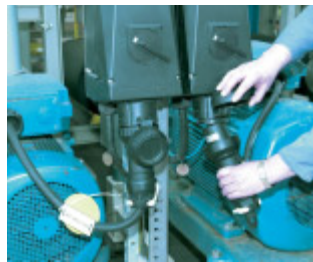
Picture 2: Simply by pulling the plug, the current can be removed from the drives.

Merely by pulling the plug, the apparatus is visibly and safely separated from the power supply, thus significantly increasing the personal safety of the maintenance staff. Since no onsite electrical work is necessary for the mechanical replacement of the apparatus, these tasks can be carried out completely by a works craftsman or service technician. If all factors are considered, a savings potential of about 68 percent (cost-benefit analysis by CEAG Sicherheitstechnik GmbH, May 2003 for a model system with 2000 measuring points and a 15-year life-cycle), besides the considerable increase in work safety and significantly reduced downtimes in production.