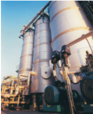
Picture 5: Plugs and sockets for up to 32 A for outdoor installations (source: Bayer AG).

Another important factor for the use of these plug-and-